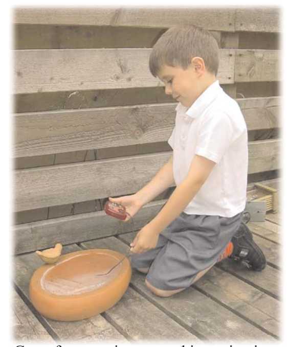
Great for experiments and investigations