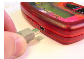
Plug in and your data appears!