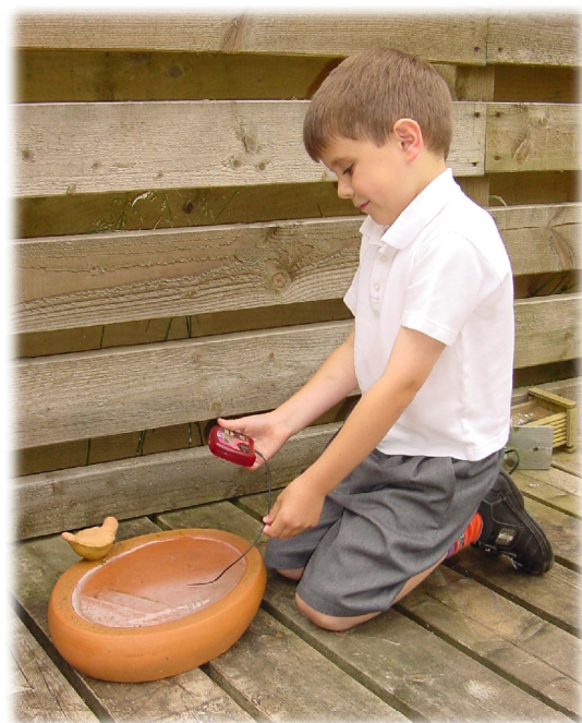
Great for experiments and investigations

Tough! Oh yes, it's designed with the real world in mind. With the weatherproof wallet you can leave EDDI outside for a few days to see how light levels and temperature vary through days and nights and also monitor the rush-hour noise pollution levels.